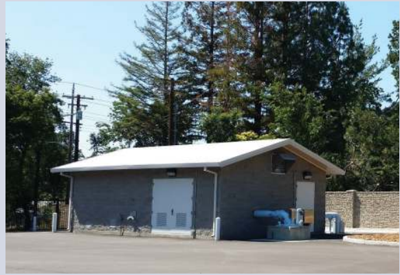
The Skycrest Well was completed in 2016 providing water at more than 2,000 gallons per minute of production capacity.