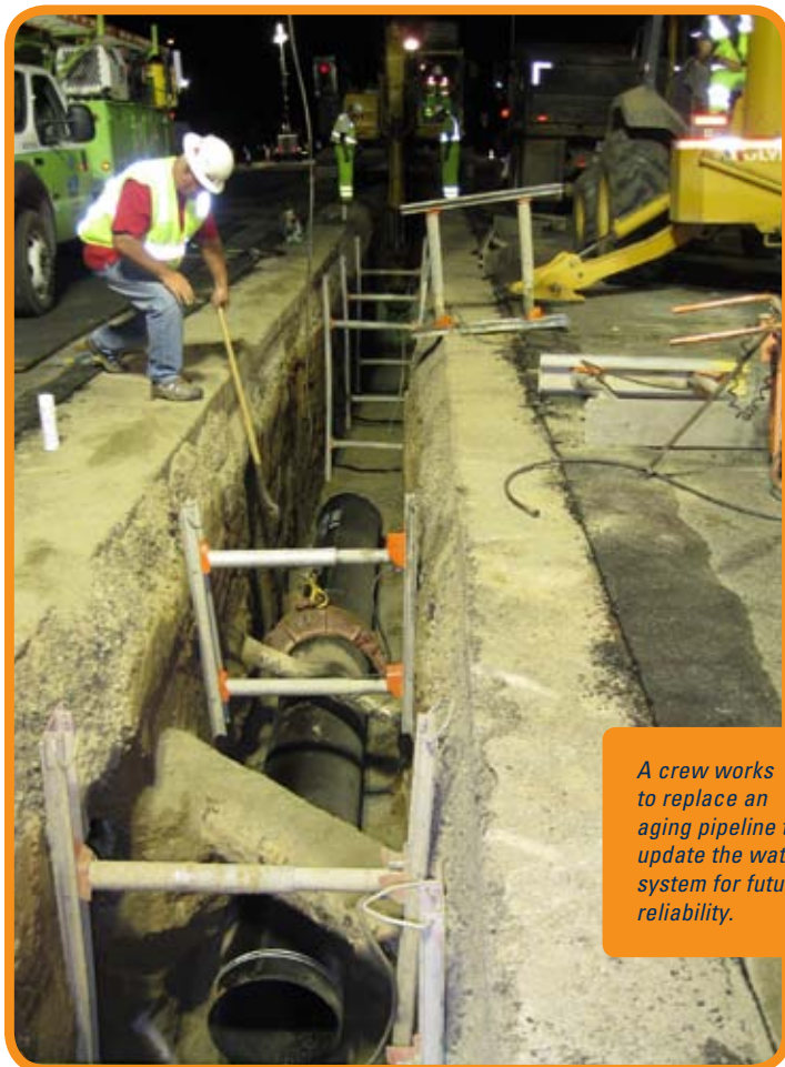
A crew works to replace an aging pipeline to update the water system for future reliability.

In spring of 2013, CHWD completed several large-scale projects involving distribution main replacements on Livoti Avenue and Frances Avenue in south Placer County. New transmission and distribution main installations on Antelope Road and Lauppe Lane and Old Auburn Road between Sunrise Boulevard and Soquel Way have also been completed. Other smaller residential main replacement projects were recently finished on portions of Northlea Way, Baird Way and Kalamazoo Drive in Citrus Heights.