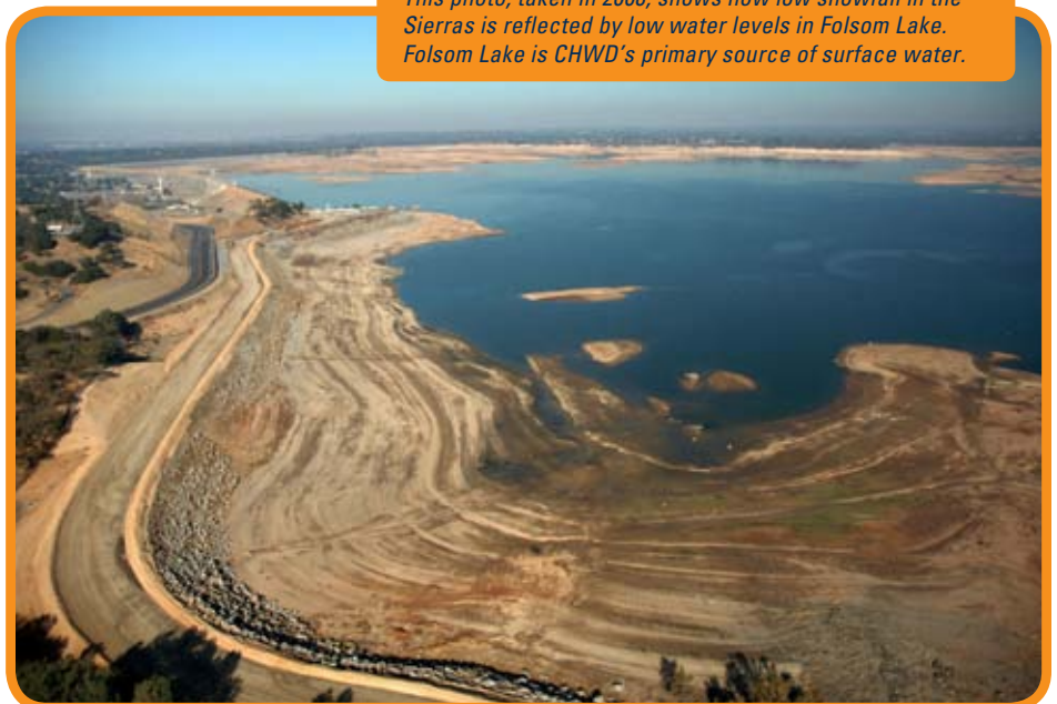
This photo, taken in 2008, shows how low snowfall in the Sierras is reflected by low water levels in Folsom Lake. Folsom Lake is CHWD's primary source of surface water.

Since Mother Nature is unpredictable, we never know when the next “wet” winter will occur. CHWD encourages customers to be mindful of their water use. CHWD customers have been very good stewards of their water—let’s keep up the good work! For more tips about water conservation, see the article “Be Water Smart this Summer.”